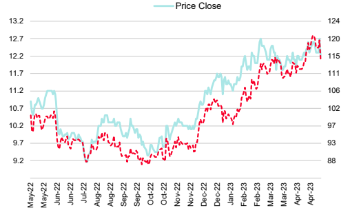
AP Thailand PCL (AP TB)